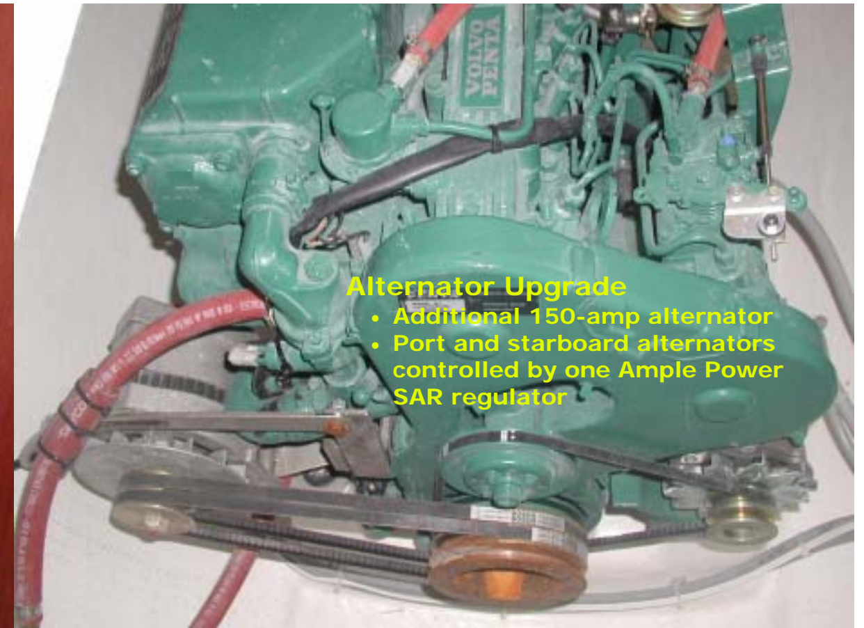
Alternator Upgrade • Additional 150-amp alternator • Port and starboard alternators controlled by one Ample Power SAR regulator