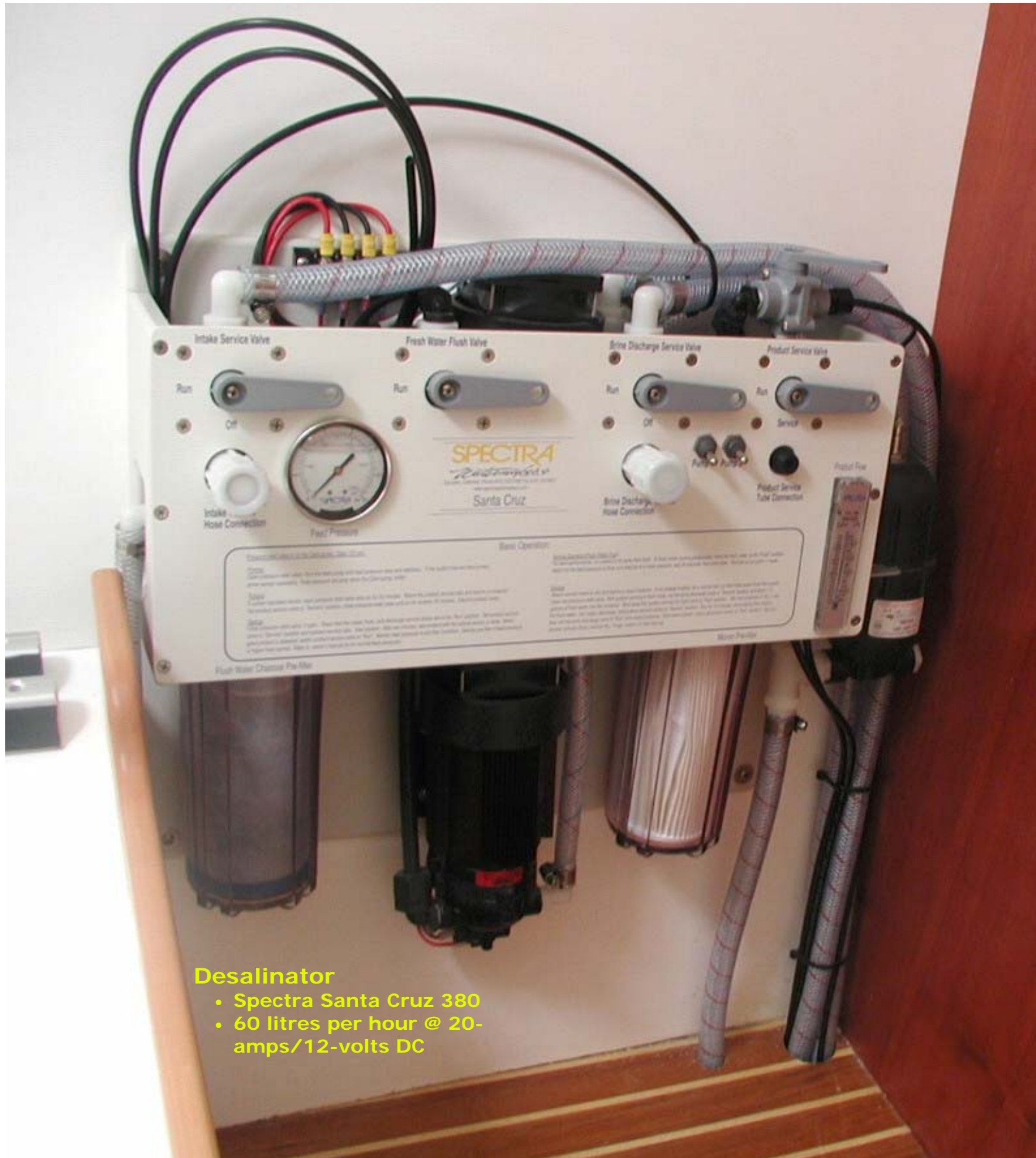
Desalinator • Spectra Santa Cruz 380 • 60 litres per hour @ 20-amps/12-volts DC