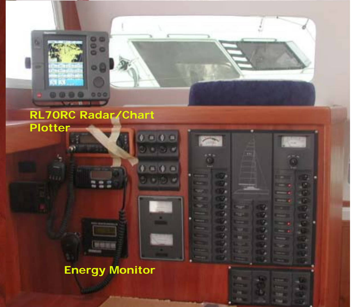
RL70RC Radar/Chart Plotter