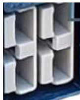
Figure 3 – Dual Grey Anderson Plugs

For connected chargers and devices, a grey Anderson plug must be used. Check to ensure the Anderson is correctly wired (positive and negative) and do not attempt to use any coloured Anderson other than grey.