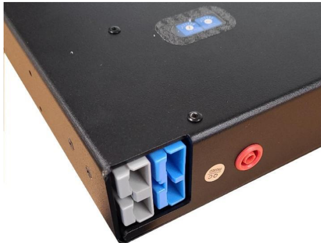
Figure 4 – DC Model Anderson Connectors

The blue connector is reserved for a DC input, to make use of the internal DC-DC charger. The DC-DC charger is rated for 20A input from a vehicle alternator or start battery.