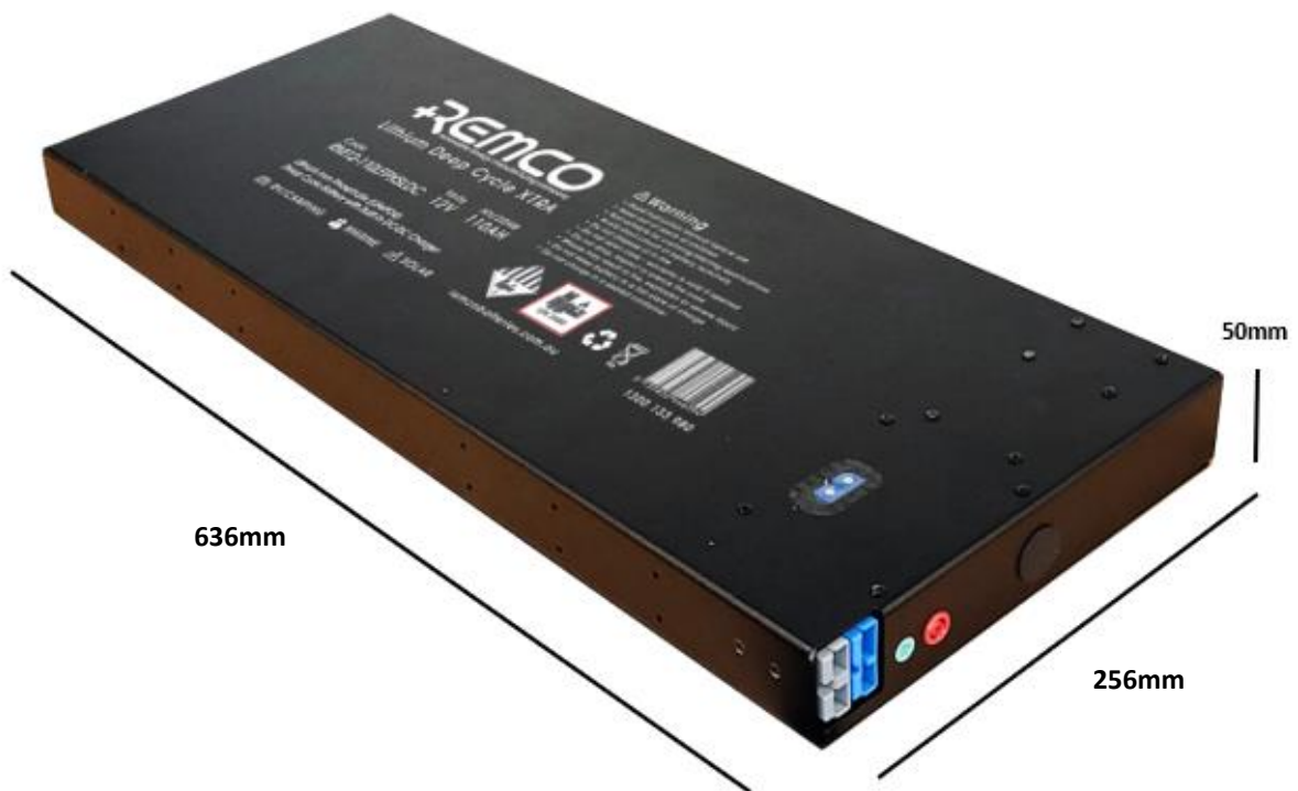
Figure 7: Super Slimline Specifications